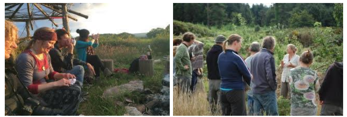
Another way of thinking of permaculture is applied ecology or systems thinking design. For example, we understand that physics is a description and understanding of natural laws and that engineering is the taking of these laws and using them to design human constructions. The "ah ha" that Mollison had as an ecologist was why not use these natural principals for human designed systems.

These questions resulted in the creation of the permaculture principals and the 72-hour permaculture design certificate. In creating it Mollison and Holgrem took a radically different approach of learning from and mimicking design principals found in natural systems. The principals they created are very simple and even might be considered common sense to some. For example, use and value diversity , produce no waste and increase or decrease different niches , work with patterns .